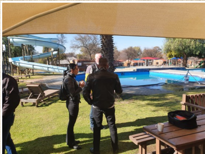
The 3 Swimming pools are undergoing winter maintenance and repainting. Also there is a 4th swimming pool being dug and which will be under cover and heated.