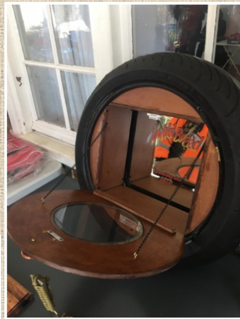
Wide Rear Tyre Cabinet with LED Lights as a Prize

The venue really only started filling up from around 12h00 onwards and fast too where chairs space